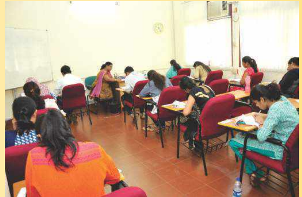
Pre Ph.D. Examination