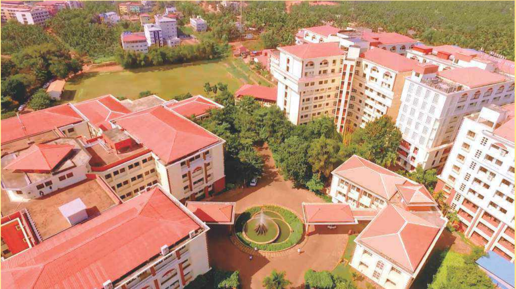
Aerial view of Yenepoya (Deemed to be University)