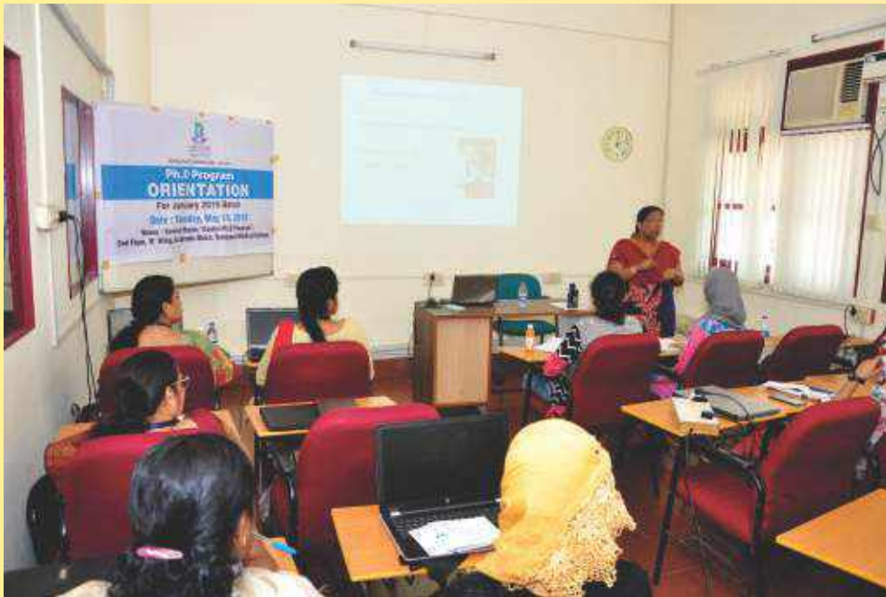
Ph.D. Program Orientation