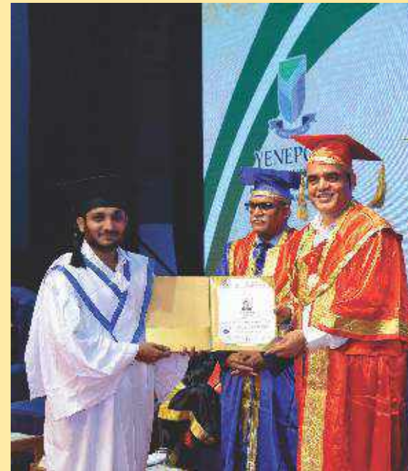
Convocation & Degree Certificate